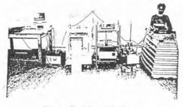
Fig. 1 : Experimental set up.

concave portions which came in contact with the skin are padded with foam rubber enclosed in the rubber sheeting to prevent skin irritation. The back portion is fitted to the chamber with studs. The front portion rests on the chamber opening and can be moved up and down. After the subject sits inside the chamber, the back portion is fitted to the chamber covering the back portion of the chamber as shown in Fig.1. The seal between the subject and the